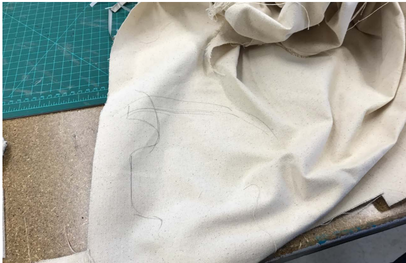
cutting the canvas