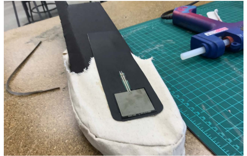
attaching the pressure sensor