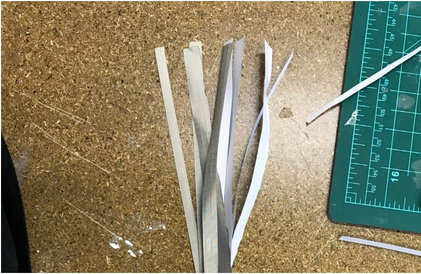
cutting strips of conductive fabric