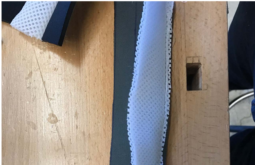
cutting the fabric